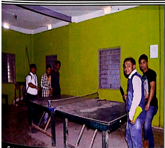
GAMES ROOM FOR COLLEGE STUDENTS'