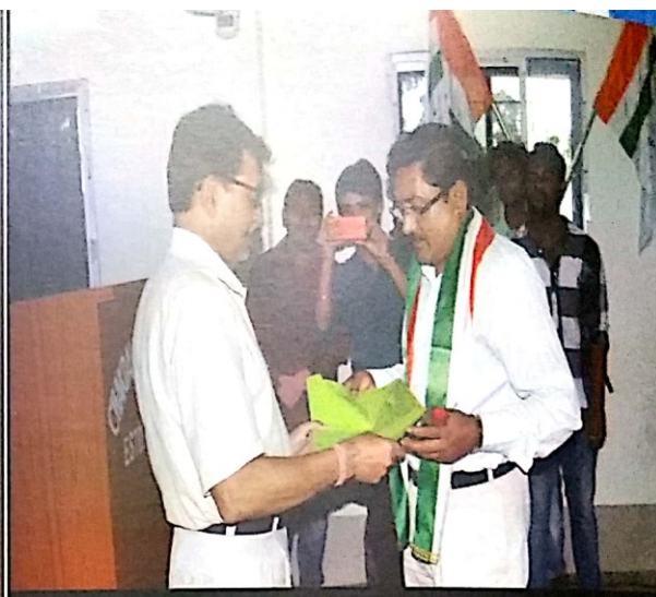
TEACHERS' DAY CELEBRATION ORGANISED BY STUDENTS' UNION