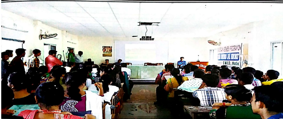
MASS AWARENESS PROGRAM ON "JAL DHORO JAL BHORO" BY GOVT OF WEST BENGAL