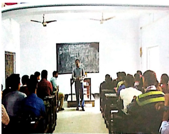
EXTENSION LECTURE OF COMMERCE DEPT.