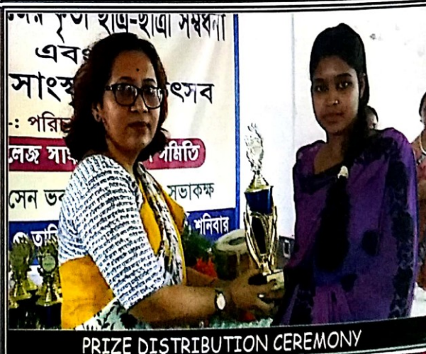
PRIZE DISTRIBUTION CEREMONY