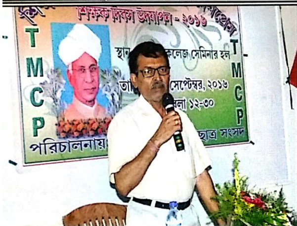
LIVERED LECTURE BY THE HON'BLE PRESIDENT GOVERNING BODY ON TEACHERS DAY