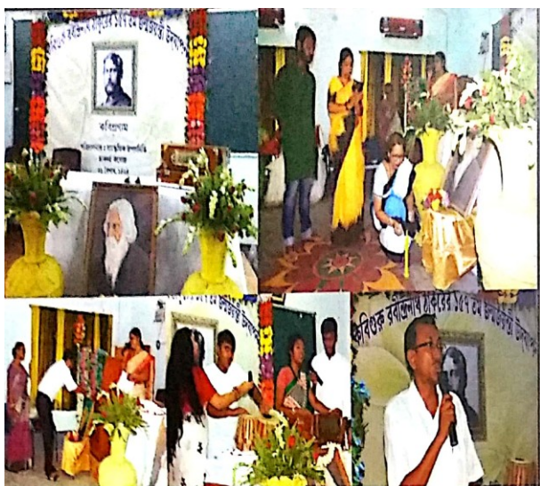
রবীন্দ্রজয়ন্তী উৎসব ১৪২৪