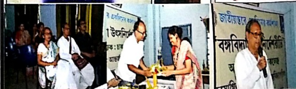
জাতীয়স্তরে একদিনের কর্মশালা "বঙ্গবিদ্যা উৎসনির্দেশরীতি"