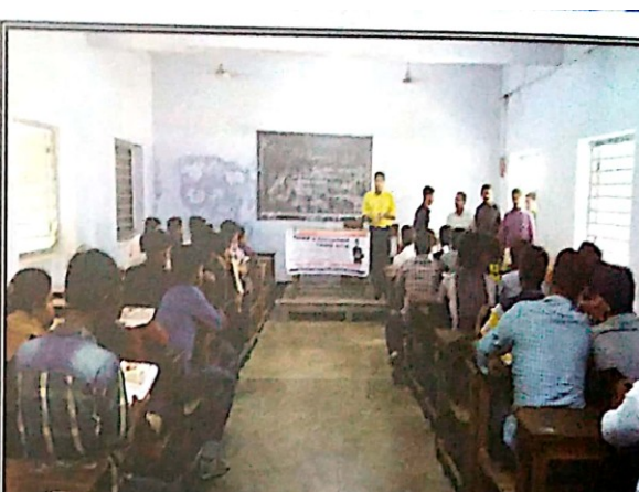
CAREER COUNSELLING PROGRAMME ORGANISED BY CAREER COUNSELLING CELL