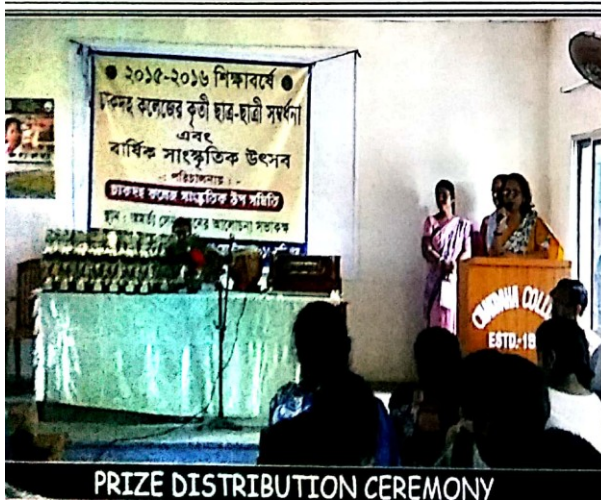
PRIZE DISTRIBUTION CEREMONY