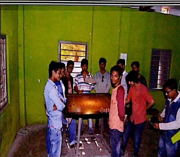
GAMES ROOM FOR COLLEGE STUDENTS'